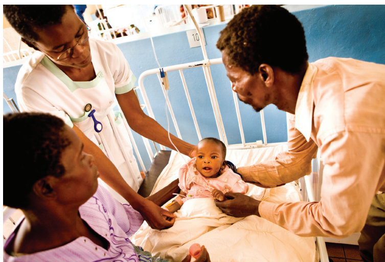
Malawi: an infant malaria patient receives life-saving treatment

Since 2001, HIV incidence has fallen by more