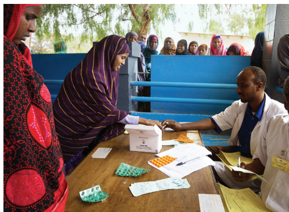
Somalia: women receiving effective TB medication