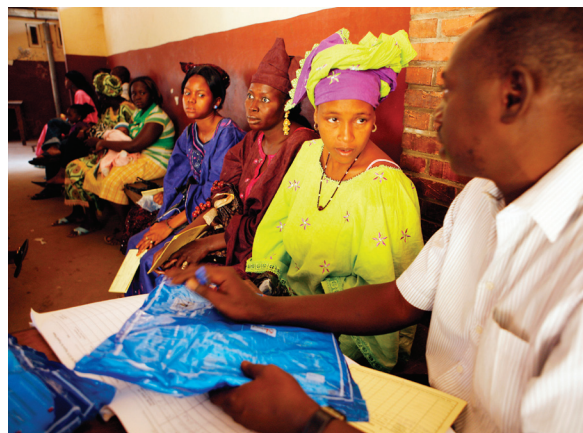
The Gambia: pregnant women receive bed nets