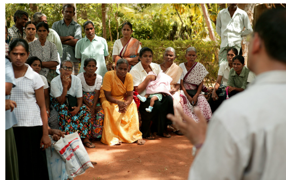
Sri Lanka: gathering vital information where it matters

A multilingual team of ten (including Kiswahili, French and Arabic speakers) has been selected from across disease areas and stakeholder groups to facilitate the conference and all plenary sessions will be interpreted. The quality of participation will be enhanced with “pre-skilling” sessions held for invitees before the conference to support clear understanding of Global Fund policies and the draft corporate strategy.